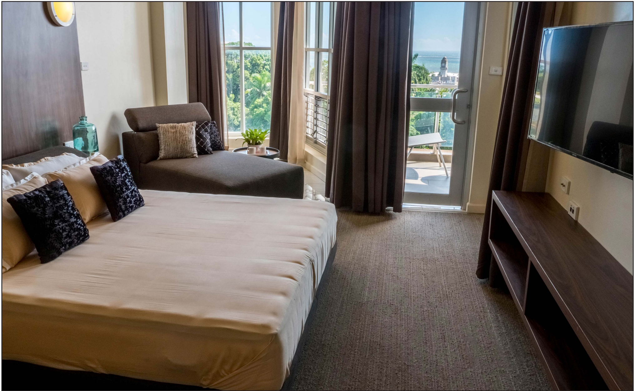
Penthouse Master Suite with City views