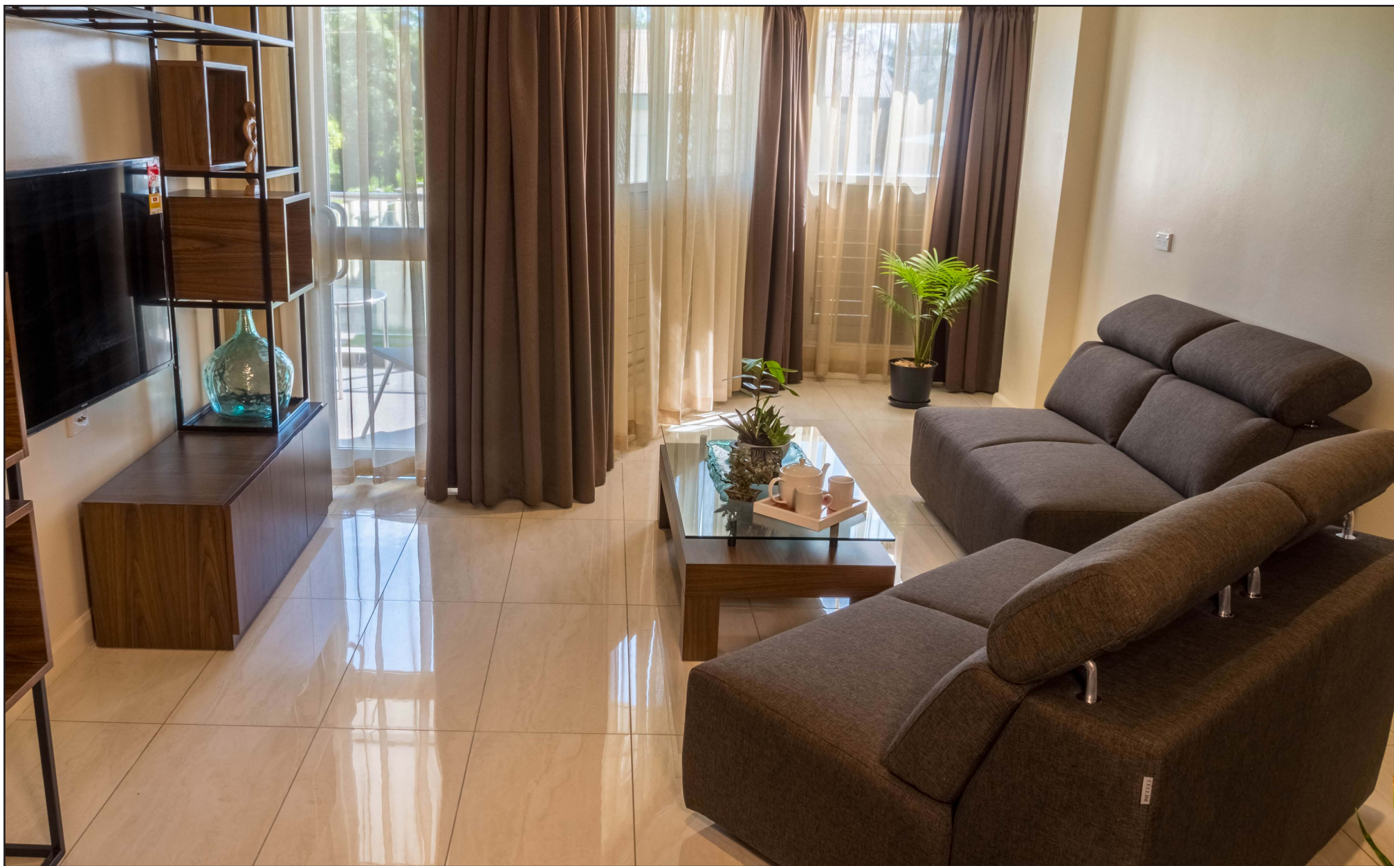
Two Bedroom Executive Apartments