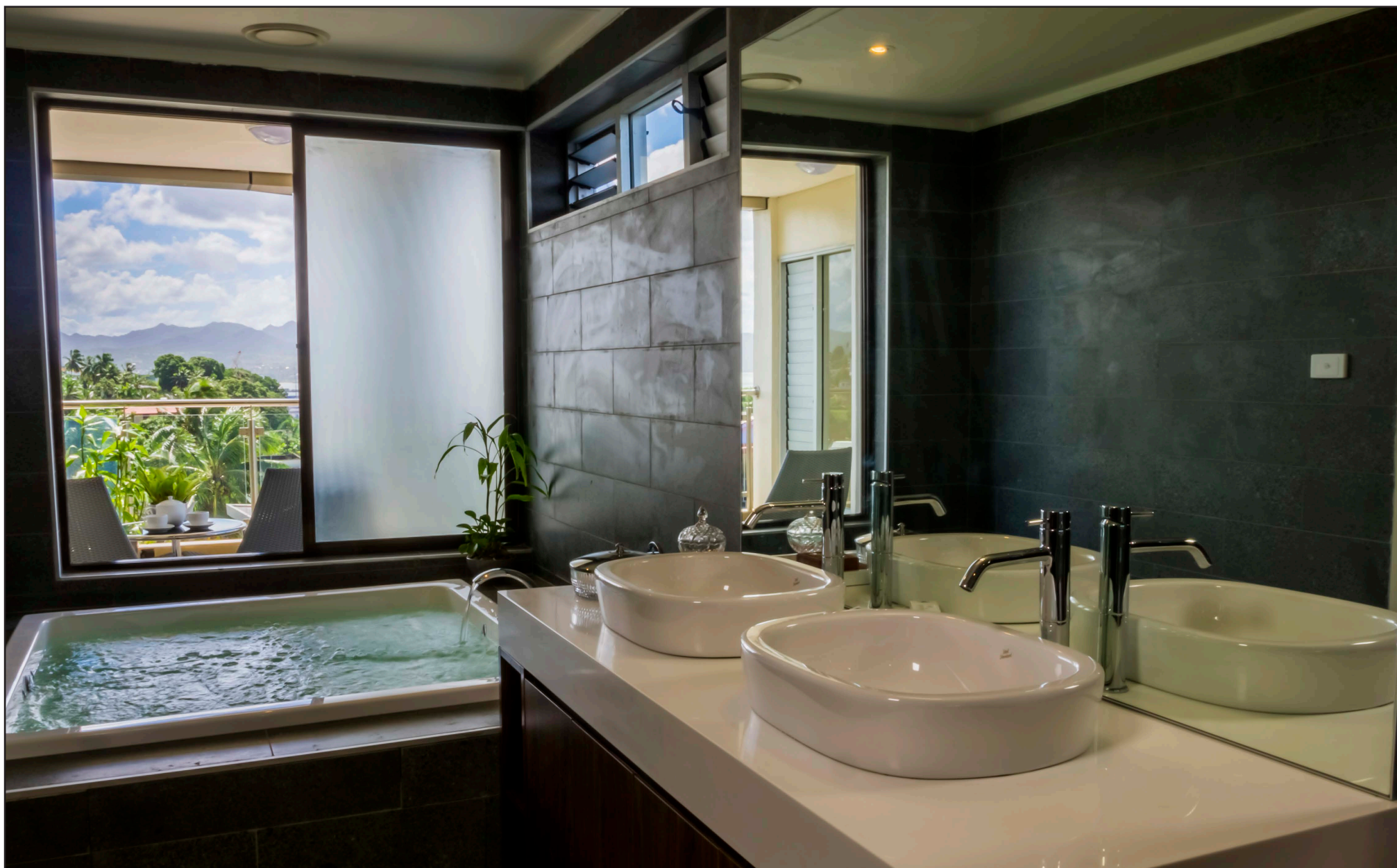
Master Bath with private balcony