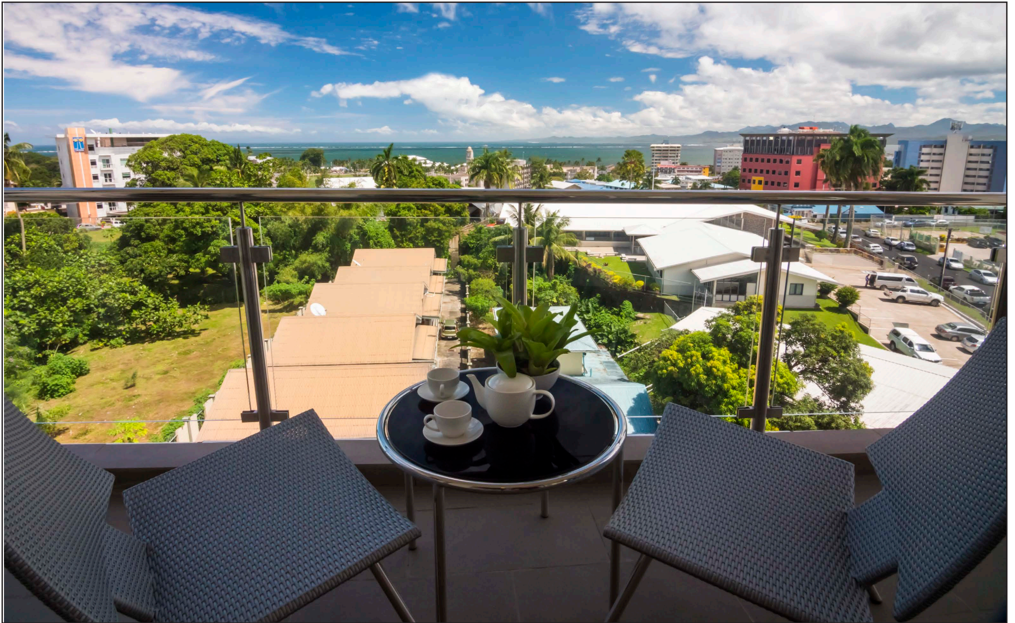
2 Level 3 Bedroom Penthouse with Panoramic City and Harbour views