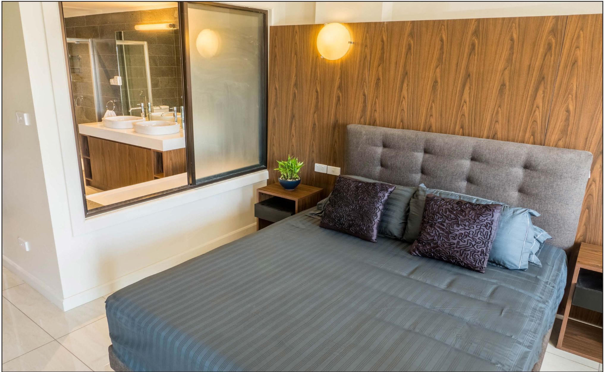
Executive Master Bedroom with full bath